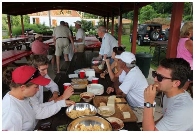
Click here to see more photos at cometclass.com.